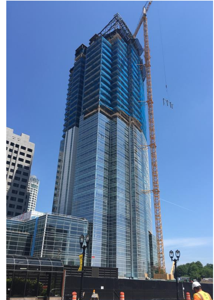
Northwestern Mutual Real Estate