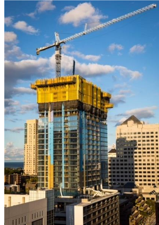
Northwestern Mutual Real Estate